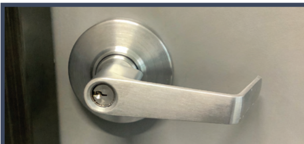
What you see